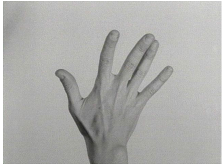
Hand Movie, 1966