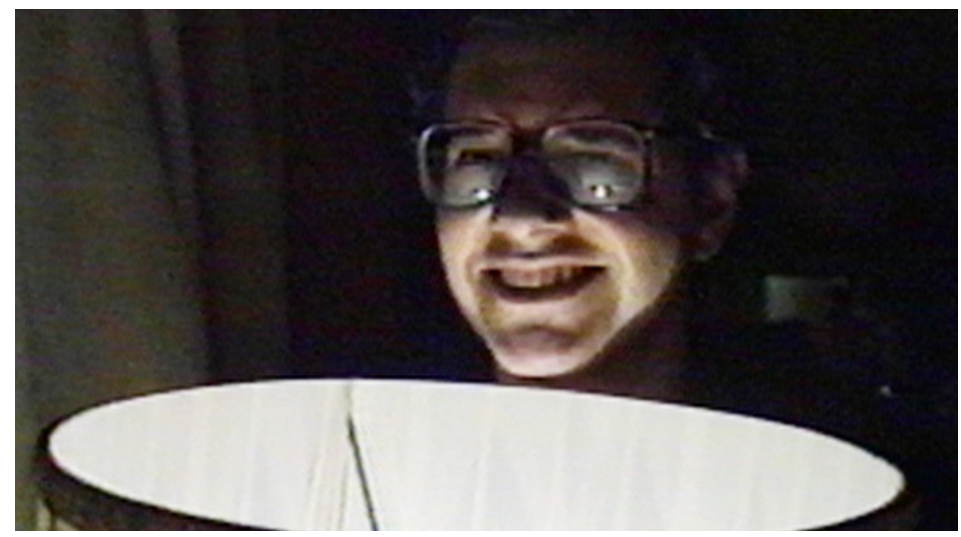
Cult of the Cubicles, 1987

never that of others. He reaches out, but he doesn't really want to fully engage the world. His subjective enclosure is isolating, but it is also protective, so he retreats into it and he takes us with him.