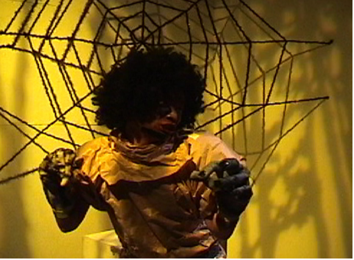
atch, 1990 Kaponga Island, 2004