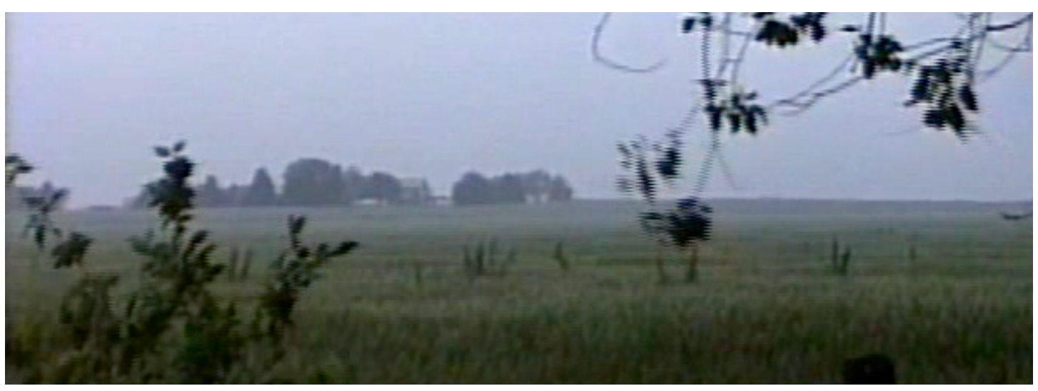
Weather Diary 6, 1990

run throughout the diaries. I discuss the most important ones in this essay and cite some examples.