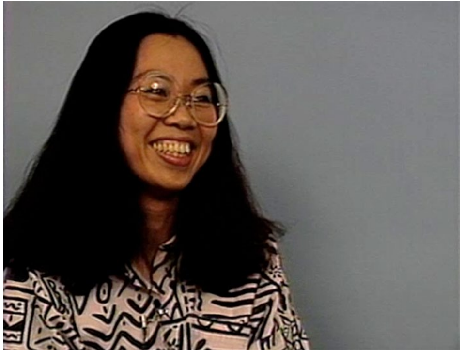
Trinh T. Minh-ha: An Interview , Blumenthal/Horsfield 1989

television, points to stakes of the interview form and its proliferation during this period. As such, Horsfield and Blumenthal's efforts to construct an archive of interviews for and by artists tackled the hegemony of TV interview aesthetics and cultural scripts of questioning.